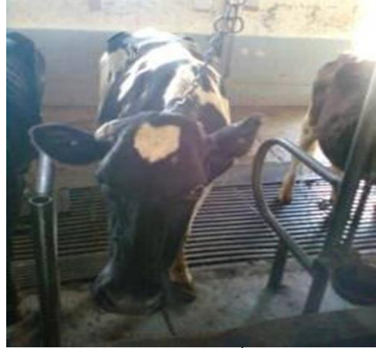
Fig. 2 A Cow during the 5 th week postpartum showed loss of body weight due to ketosis.

BCS of peri-parturient cows showed a significant decrease than heifers during postpartum period (Fig. 4-5 and Table 1).