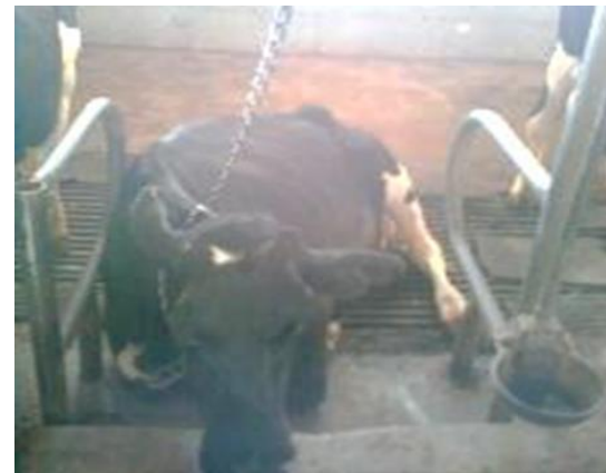
Fig. 3 A recumbent cow during the 1 st week Postpartum showed sternal recumbency due to milk fever.