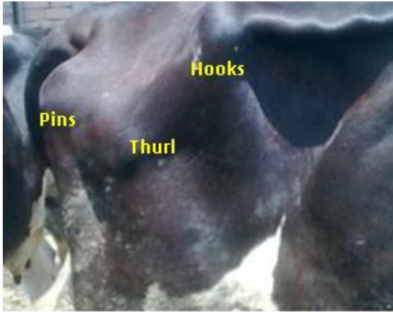
Fig. 5. A cow during postpartum period showed loss in body condition score (V-angle area formed between hooks, thurl and pins).